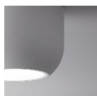
BC Wrinkled white