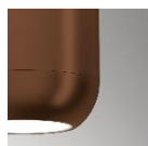
BR Matt bronze