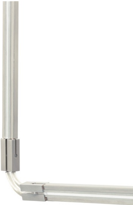
MonoRail Flexible Vertical Connectors