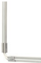
MonoRail Flexible Vertical Connectors