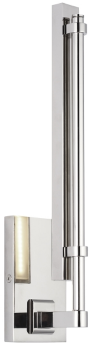
Polished Nickel (Alt)

Includes 8.6 watt, 397 delivered lumens, 3000K LED module. 120V dimmable with most LED compatible ELV and TRIAC dimmers. 277V compatible with 0-10V dimmers. Mounts horizontally or vertically. Up or downlight.