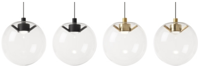
Nightshade Black Nightshade Black 2 Natural Brass Natural Brass 2

To view all available finish options, please visit techlighting.com